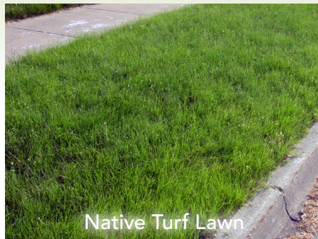
Native Turf Lawn