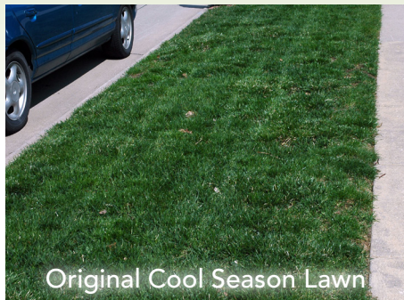
Original Cool Season Lawn